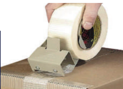
3M™8954 is abrasion and scuff resistant

On the overleaf there is just a small selection of our most popular packaging tapes. We offer many more products within this range. If you have a requirement you would like to discuss please contact your Area Sales Manager or nearest branch.