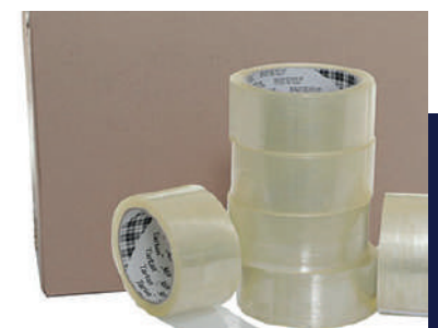
3M™ 309 low noise tape for busy environments