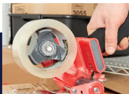
3M™ general purpose box sealing